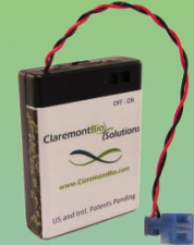
Reusable battery pack

No additional equipment needed ...with comparable results!